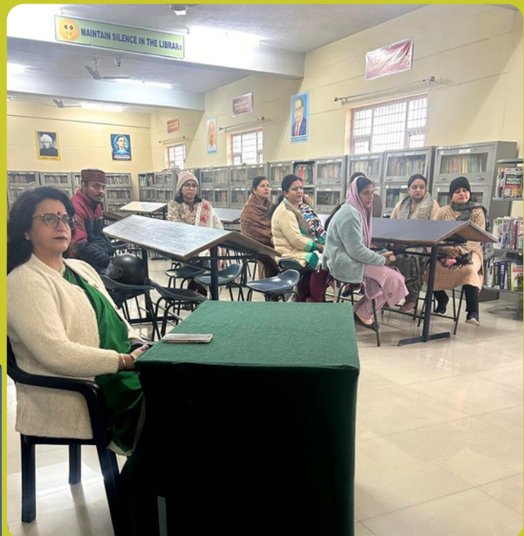
PARENTS' VISIT TO SCHOOL LIBRARY

In a bid to strengthen the bond between the school and parents, the school took an opportunity to invite the parents of classes VI & VII to a special visit to School Library and Labs on 20 Jan 2024 . The session witnessed an array of engaging activities which included watching a video on the importance of reading books by Gulzar, a renowned Indian Urdu Poet, exploring no. of Books, Periodicals and the contents of Electronic Library, furnished with Kindles and various digital materials. The parents also visited science labs & IT lab of the school.