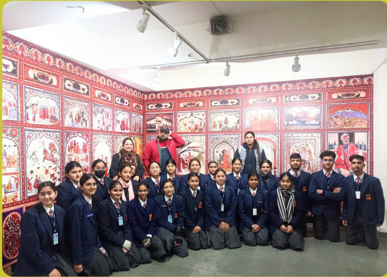
STUDENTS' VISIT TO DOGRA ART MUSEUM