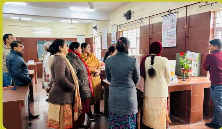
PARENTS' VISIT TO SCHOOL LABS

In a bid to strengthen the bond between the school and parents, the school took an opportunity to invite the parents of classes VI & VII to a special visit to School Library and Labs on 20 Jan 2024 . The session witnessed an array of engaging activities which included watching a video on the importance of reading books by Gulzar, a renowned Indian Urdu Poet, exploring no. of Books, Periodicals and the contents of Electronic Library, furnished with Kindles and various digital materials. The parents also visited science labs & IT lab of the school.